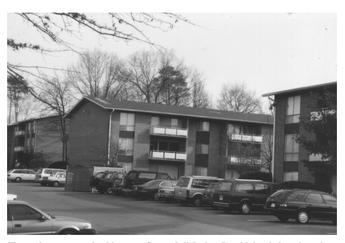
Typical apartment buildings in Springhill Lake. Doubleloaded parking lots are typical in front of apartment buildings.

These policies, although not mandatory, guide the Springhill Lake concept, include public-sector actions and frame the Development District Standards contained in the SMA section for development or redevelopment in Springhill Lake.