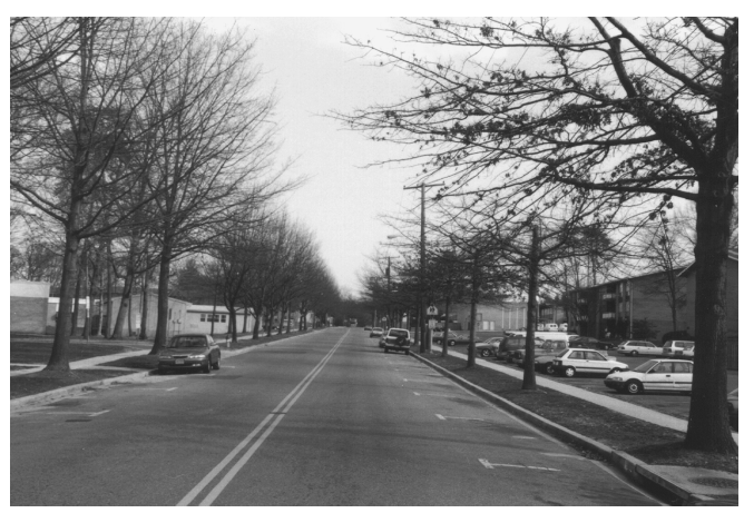
View looking east along Springhill Drive.