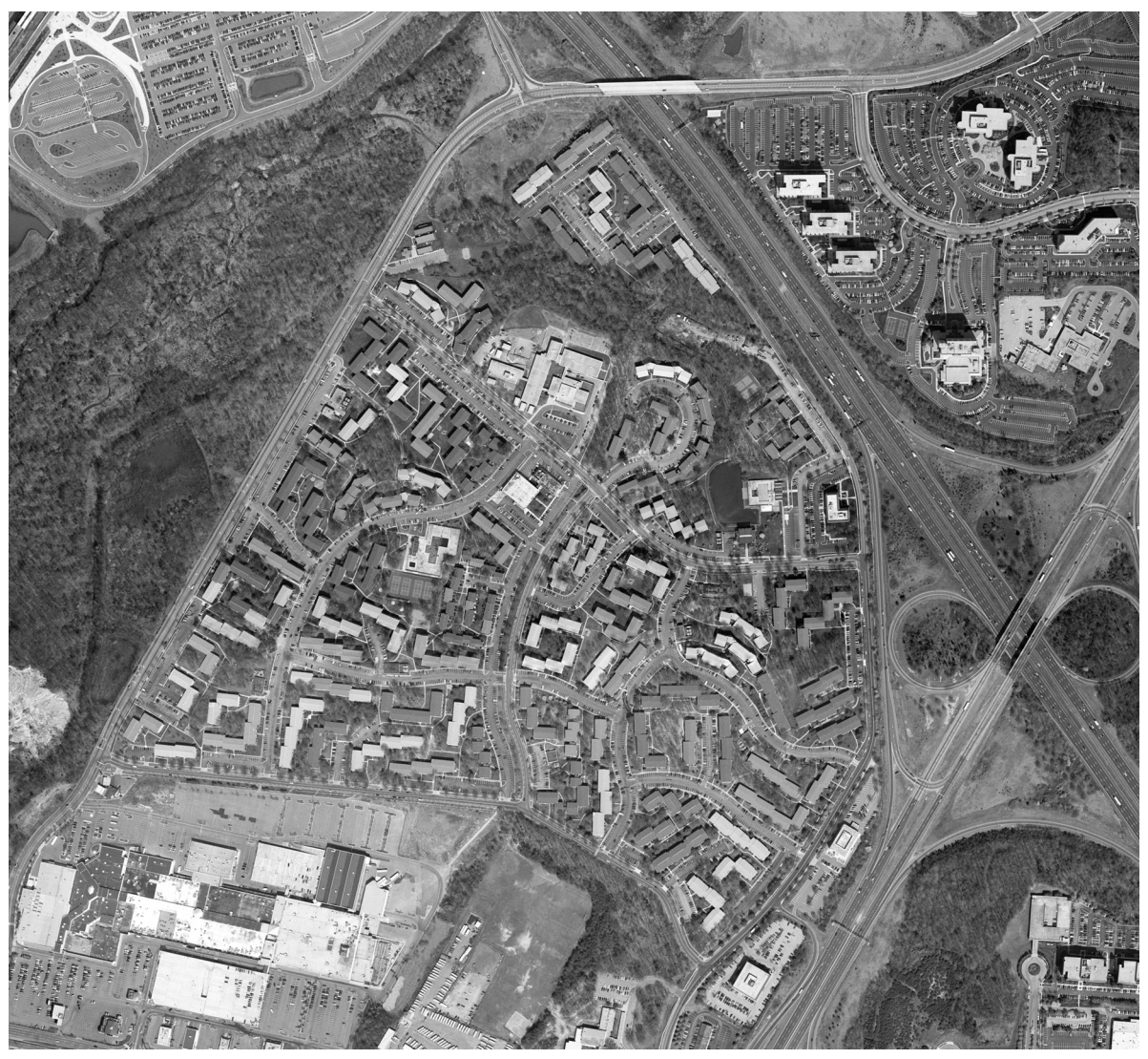
1998 aerial photograph of Springhill Lake apartments and vicinity.

path to the station site is not ideal for pedestrians and could be improved to provide more convenient and safe access for residents of the western end of Springhill Lake.\(^1\) The other issue is safe pedestrian crossing of Cherrywood Lane.